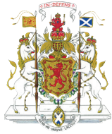
Mary, Queen of Scots